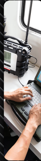
SERVICE & RENTAL